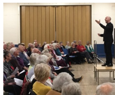
Carols at Christmas