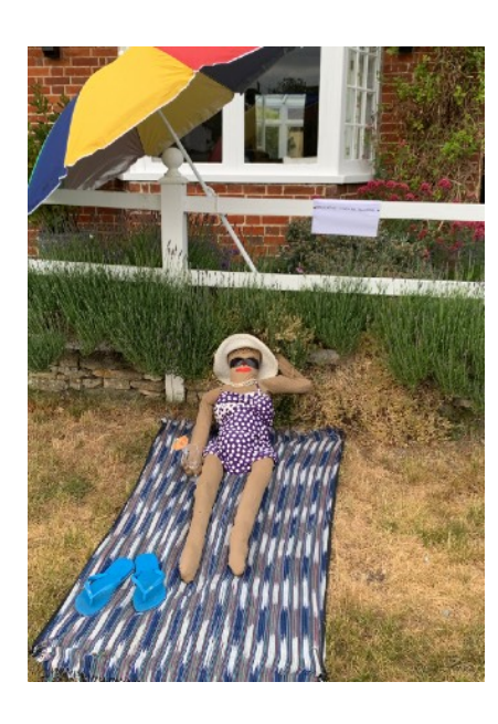
Staycation Costa Townsend