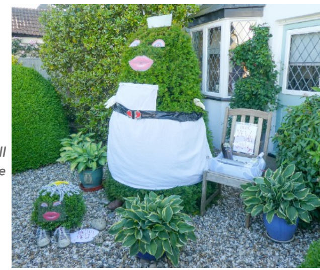
Hope yew will smile