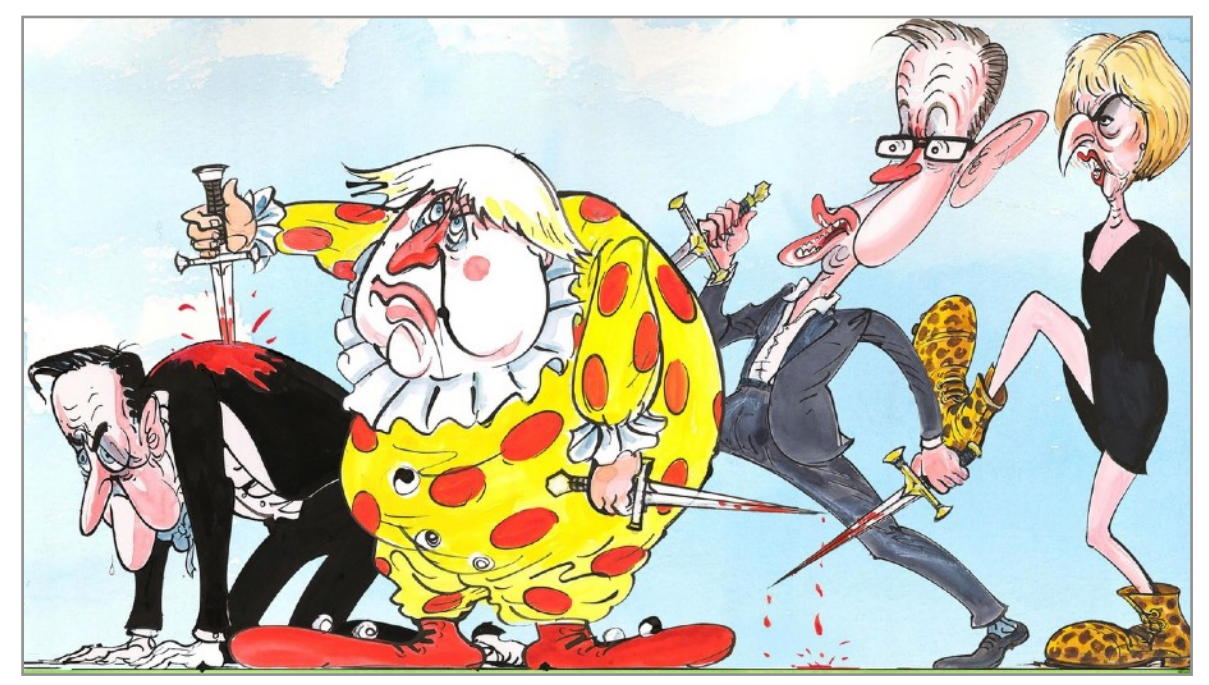
'Honourable Members' Gerald Scarfe, Sunday Times , 3 July 2016