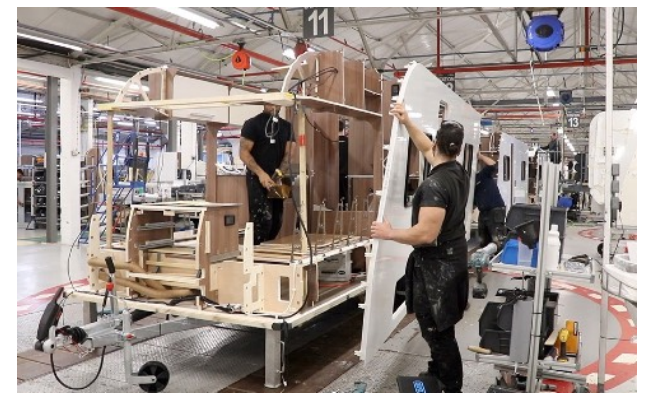
Final assembly at Bailey Caravans

Roger then showed a fascinating video tour of the Bailey Caravans works in Bristol, which would have been difficult for the group to visit anyway because of distance, the split manufacturing and assembly sites and lack of safe space around the production lines. We followed construction from the semiautomated bonding and laser-guided cutting of the composite walls and floor panels to the more