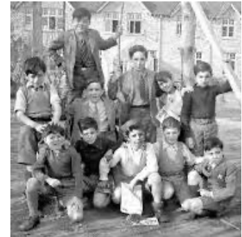
Basque refugee children