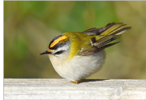
Britain's tiniest bird?

In October, Sue Oswell led 16 members of the Tuesday Walking Group on a beautiful socially-distanced walk through the autumnal beeches of Wendover Woods. Part of the route included the Firecrest Trail, where members actually heard the strident call of a firecrest, one of Britain's tiniest birds. However, as is typical, it remained out of sight. After taking in the magnificent, if misty, views across Aylesbury Vale and beyond, a fine dry outdoor picnic was enjoyed at the Café in the Woods.