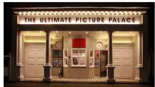
...and the fine Jeune Street facade now