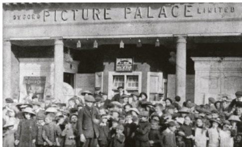
Cowley's cinema then...