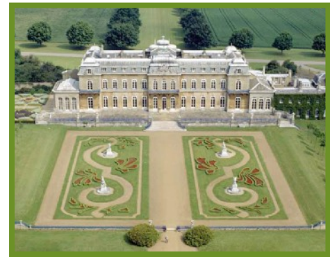
Wrest Park, Bedfordshire