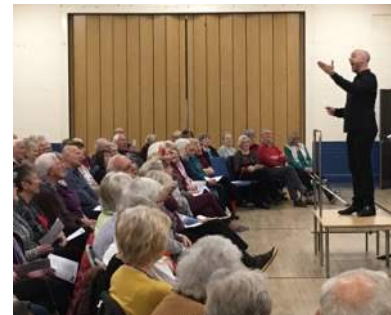
Carols at Christmas