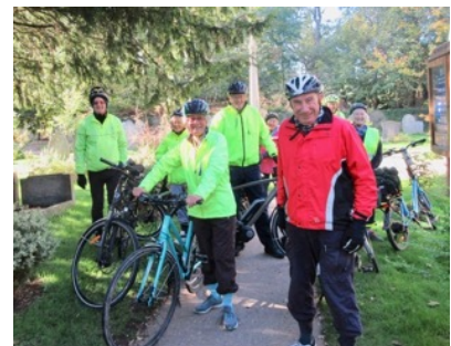
At Holy Trinity Church, Headington