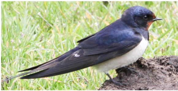
A swallow (above) collecting material for its nest after arriving from its ten thousand kilometer journey.