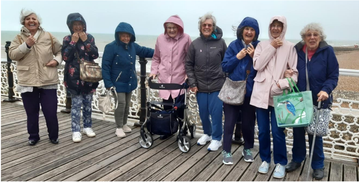
Brighton on a Summer's Day!

In true British fashion, the Out with Friends Group went on a summer seaside trip to Brighton. Nineteen of us boarded a coach at Fort End and off we went. Our first thought when we arrived was for some refreshments. Although fortunately it wasn't raining, it was blowing a gale and we had to hold on to our hats as we walked along the pier in search of a warming hot chocolate.