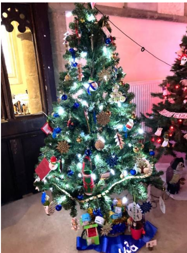
Christmas Tree Festival

🌿 We wish you a Merry Christmas and a Healthy New Year 🌿