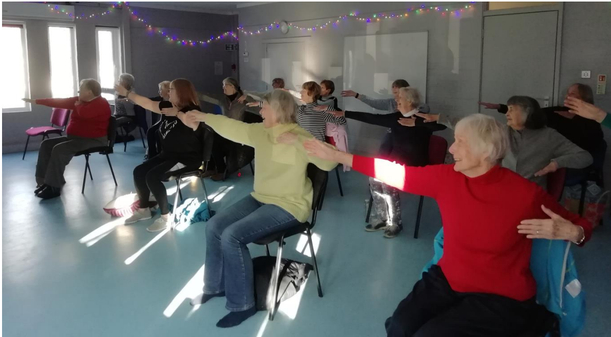
Aren't they a Lovely Lot!