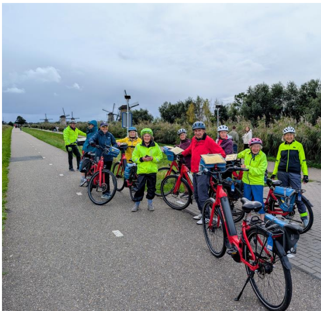
Windmills at Kinderdijk

We explored Dordrecht, Gorinchem, Utrecht, Gouda and Delft and some of us cycled to The Hague. There were so many different highlights. Some loved the varied architecture of the houses best, and some the 19 windmills at Kinderdijk.