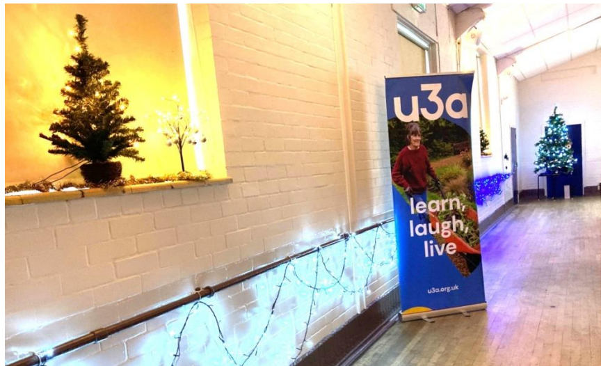
Christmas Celebrations in the Village Hall